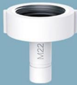
M22 Male thread adapter