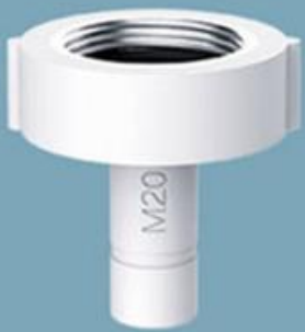
M20 Male thread adapter

Suitable for mainstream faucets in the market.