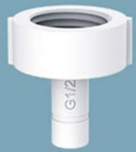
G1/2 Male thread adapter