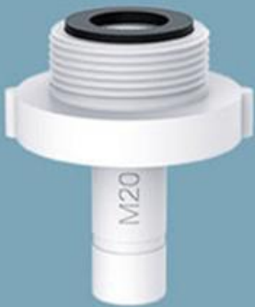
M20 Female thread adapter