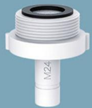
M24 Female thread adapter