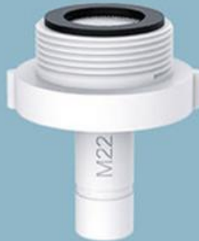
M22 Female thread adapter